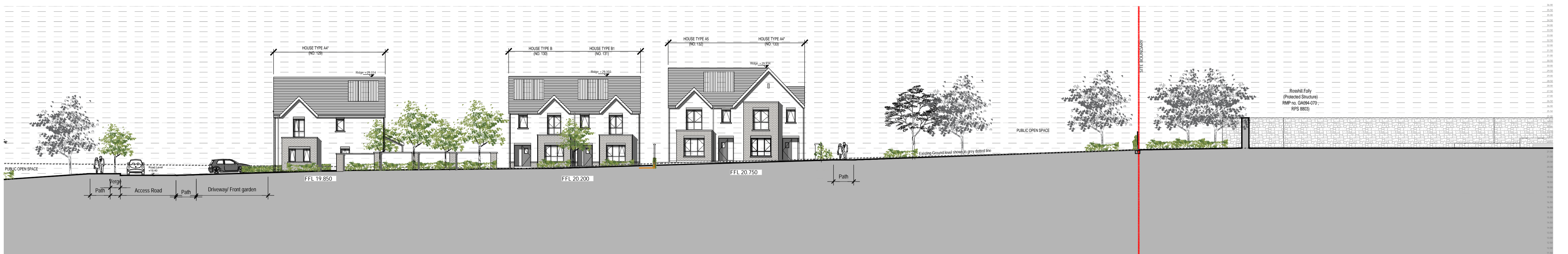
03 Site Context Elevation E-E (Part 02) Scale: 1:200