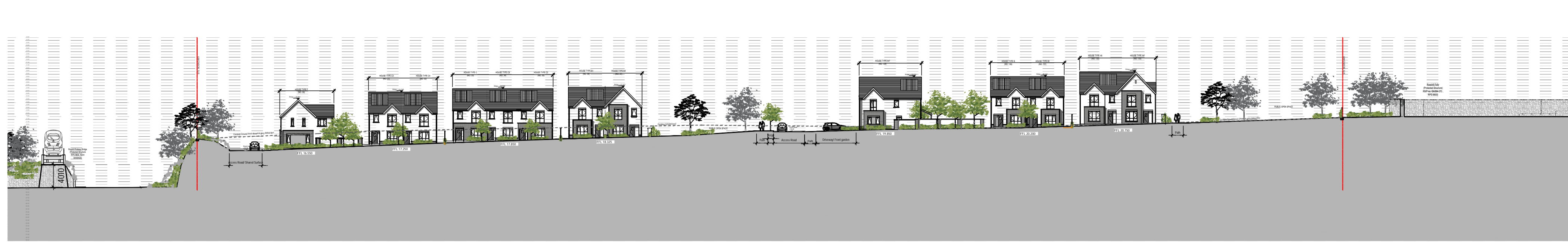
01 Site Context Elevation E-E Scale: 1:500