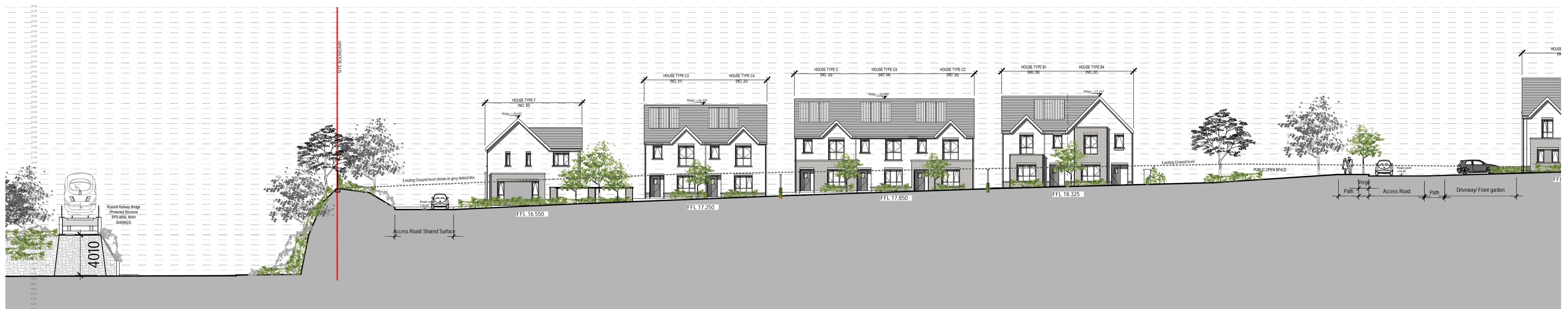
02 Site Context Elevation E-E (part 01) Scale: 1:200